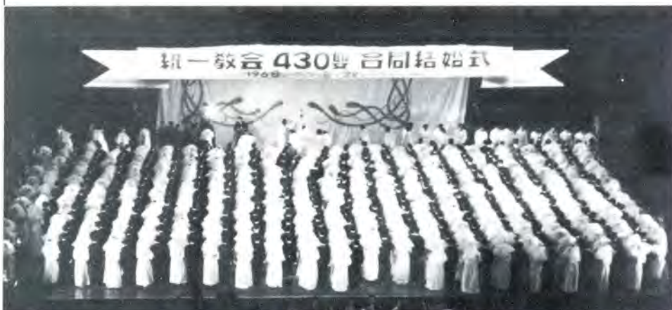
"In preparation for our blessing in 1968 about nine hundred members gathered in Seoul. I think I was one of the youngest brothers [twenty-four years of age] in that blessing group."

After the introductions were over, Father gave out paper to the candidates and instructed each of us to write down five names. The first name would be our first choice; if that was rejected, the next