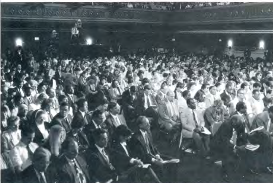
A great proclamation was made to the audience in the Manhattan Center: The New Testament Age has ended and the Completed Testament Age has begun, under the True Parents.

For decades, I have been completely misunderstood. For three years, I was imprisoned in a North Korean communist concentration camp. Altogether, I have been wrongly imprisoned six times for doing God's work. Moreover, the media have mocked me as a monster