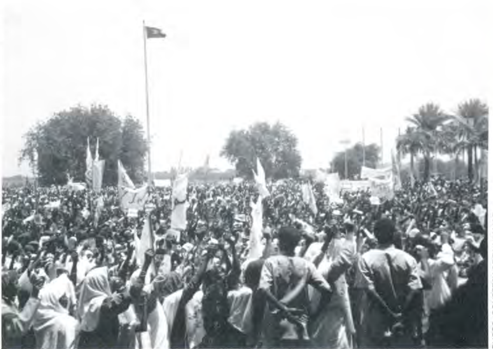
People rejoice at the news of amnesty and plans for economic development.