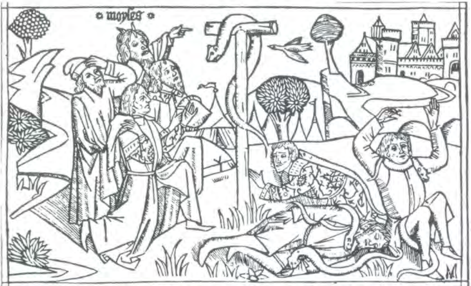
"Heavenly Father said not to look down, as we normally do, but to look up. The lesson is that, when you have difficulty, you must think of the next step of happiness; then everything is okay." The brazen serpent, Bible, Cologne, 1470s

In Matthew 16:25 we read, "For whoever would save his life will lose it, and whoever loses his life for my sake will find it." If you want to live for a good cause, you will survive. However, if you want to live for your own cause, you will die. Many blessed couples live for their own cause; then they die. When your family has problems, you should go out to witness; then your family can survive. God will take care of it. Most of us don't witness; then we become unhappy. When you go back home and watch TV with your children, it looks as if you are happy, but it is really not so happy. If I ask you how many people have found spiritual children in the last three hundred sixty-