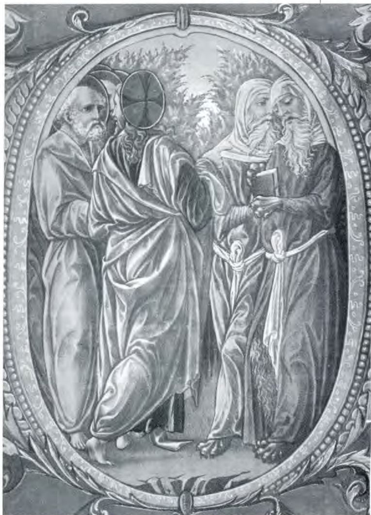
"Beware of false leaders ... by their unfruitful life you shall know them." Miniature painting from a Gradual by Liberale da Verona, 1460s, for Siena, Cathedral.