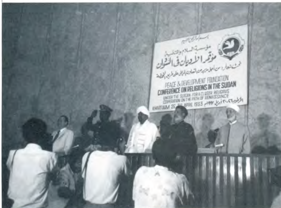
The conference opens officially with the national anthem of Sudan.