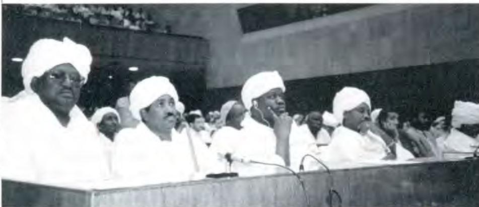
Government ministers attending the conference, including the minister of Religious Affairs, H.E. Abdalla Neil. (third from left), who has attended the forty-day seminar in New York.